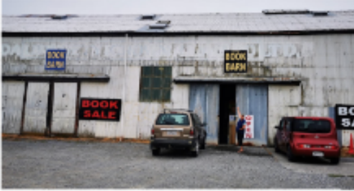
Chertsey Book Barn