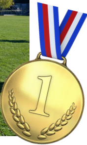
Year 3 Boys: 1st Place - Isaac Chubb