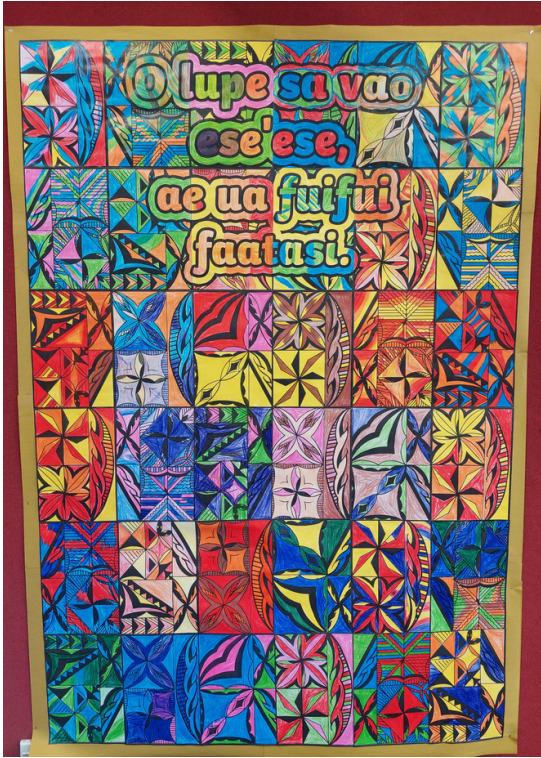
Collaborative art to celebrate Samoan Language Week