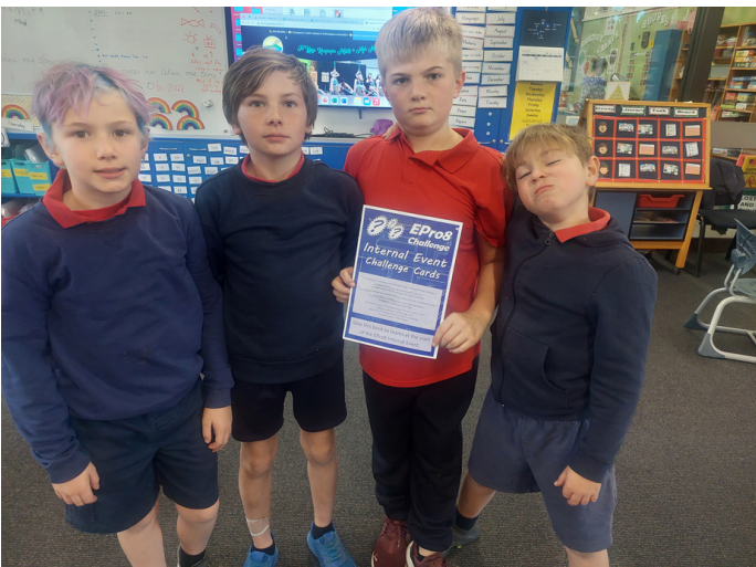
Chertsey School EPRO8 Team