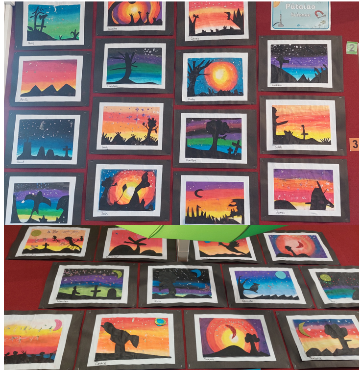
Sunset Art to reflect the Matariki Star, Pohutukawa