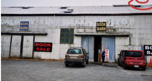
Chertsey Book Barn