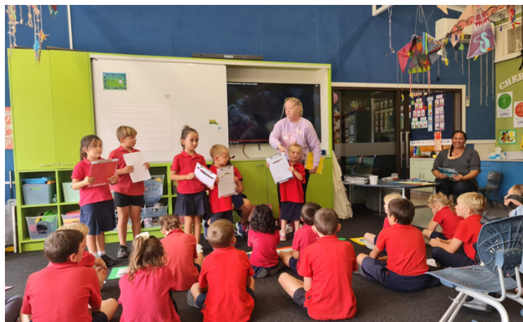
Our first assembly of the year