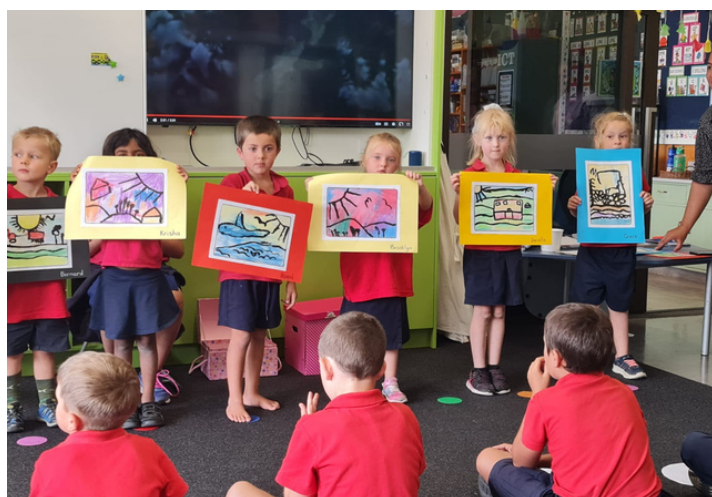
All About Me Art