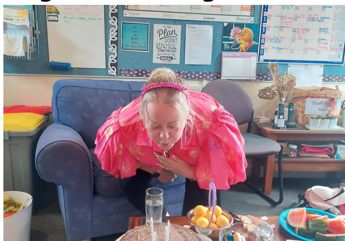
A birthday celebration